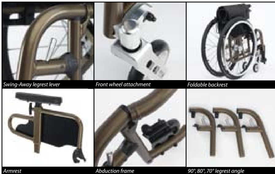
Swing-Away legrest lever